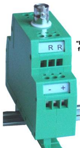
"R" and "R" - Terminals for External Reference